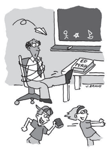
"If only I could get to my ed psych text . . ."

using many examples, relate the content of instruction to the students' background, state rules, give examples, and then restate rules.